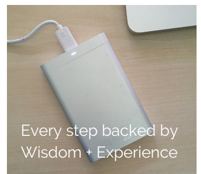
Every step backed by Wisdom + Experience